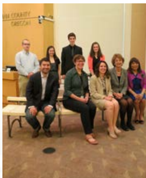
Students share the bench design with Multnomah County Commissioners.

The benches will be installed this spring. A prototype will be on view in one of the belvederes at the February 27 opening celebration.