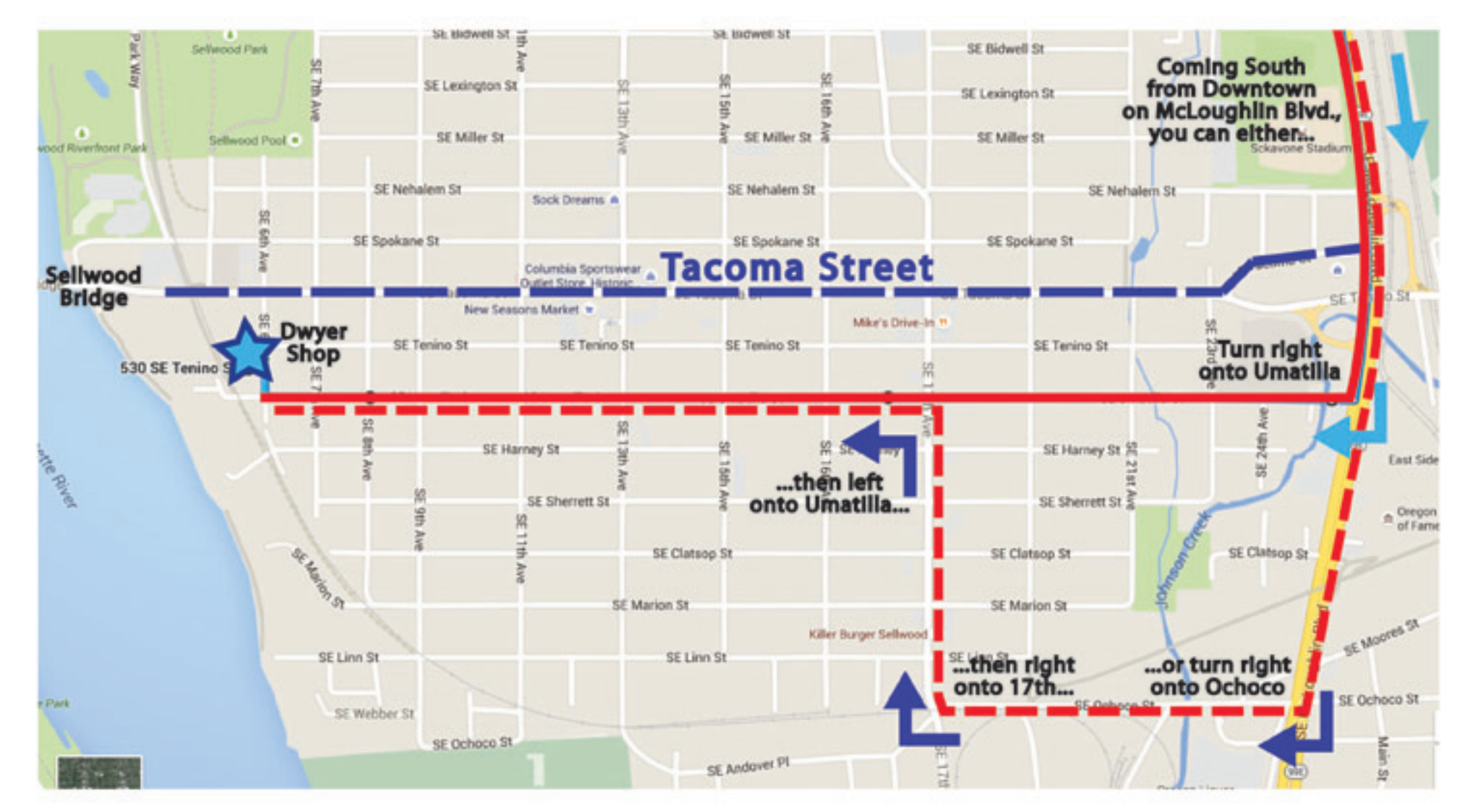
If you decided to continue on McLoughlin, DON'T TAKE THE TACOMA STREET EXIT! Instead, look for the turns for Umatilla Street or Ochoco Street, and take a right turn on either of them. Look sharp! Both streets are only a few hundred feet after the Tacoma St. exit! They also both run parallel to Tacoma Street, and Umatilla will bring you up directly behind our shop.